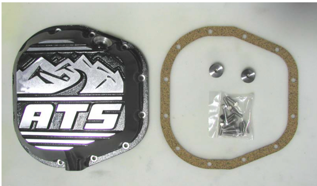
Figure 1: Sterling 10.25 & 10.5 ATS Protector Differential Cover Kit

For some installations, removing the spare tire may provide better access to the work area. It is not necessary in every case. The installer should determine if there is adequate workspace prior to starting the installation.